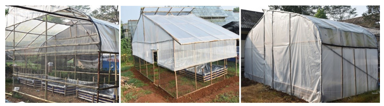
Figure 1. Rice growing structures T1 (polyethylene roof with insect screen walls, A); T2 (polyethylene roof and half of the walls from polyethylene; B) and T3 (roof and walls are fully covered with polyethylene; C)

Rice was grown in polybags and maintained under a lowland system where the water level was kept at 20 mm above the soil surface. The elevated temperature treatment was created through the use of different types of growing structures, i.e. polyethylene roof with insect screen walls with ventilation (T1; Figure 1 A); polyethylene roof and half of the walls are from polyethylene with ventilation (T2; Figure 1 B); roof and walls are fully covered with polyethylene, without ventilation (T3; Figure 1 C). The different materials used for the growing structures elevated the temperature inside the structure. Rice crops were exposed at 14 days after sowing until harvesting. The air temperature inside the plastic house during the rice growing season was periodically recorded using a thermal recorder (TR-71U, T and D, Japan). The rice crops inside the T1, T2, and T3 plastic houses were exposed to high temperatures daily from 10:00 to 14:00, 09:30 to 14:00, and 09:00 to 14:00, respectively.